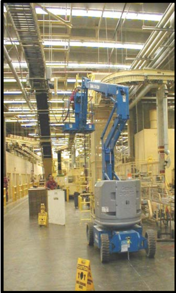
Photo eyes on the overhead product lines would become dusty resulting in unwanted machine interaction. Operations and maintenance employees would use ladders and aerial lifts to clean the photo eyes on miles of overhead lines, exposing the employees to fall hazards.