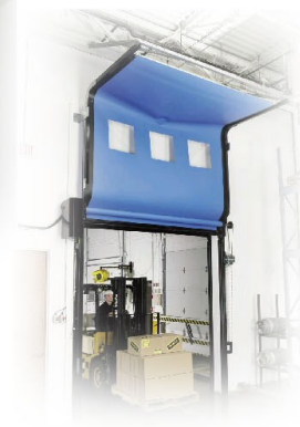
Industrial FasTrax Doors The safest, most efficient and most reliable high speed doors in the industry.