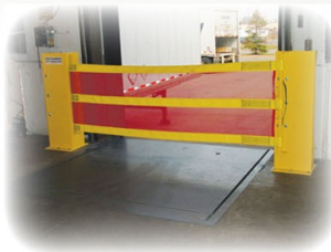
Barrier Systems Discover new cost-effective solutions to help keep your people safe and reduce equipment and product damage.