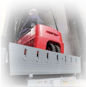
Safe-T-Lip Dock Levelers Helps prevent costly falls from vacant loading docks.