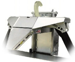
Vehicle Restraints The most effective way to prevent accidents caused by trailer separation and vertical or horizontal movement.