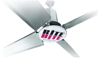
Revolution Fans An industrial ceiling fan that helps drive down energy costs while improving employee comfort.