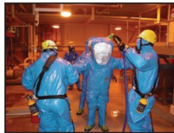
Hazardous Materials Training