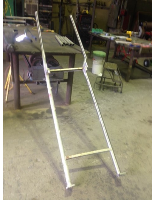
View of cracking in adjacent rung