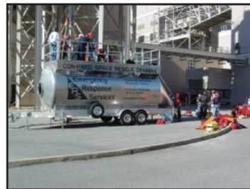
Confined Space Rescue Training