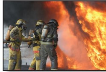
Industrial Firefighting Training