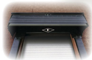
Frommelt® Seals and Shelters with RainGuard Header Seal