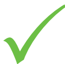
Fig. C - Back label will be marked with a green checkmark - OK for use.